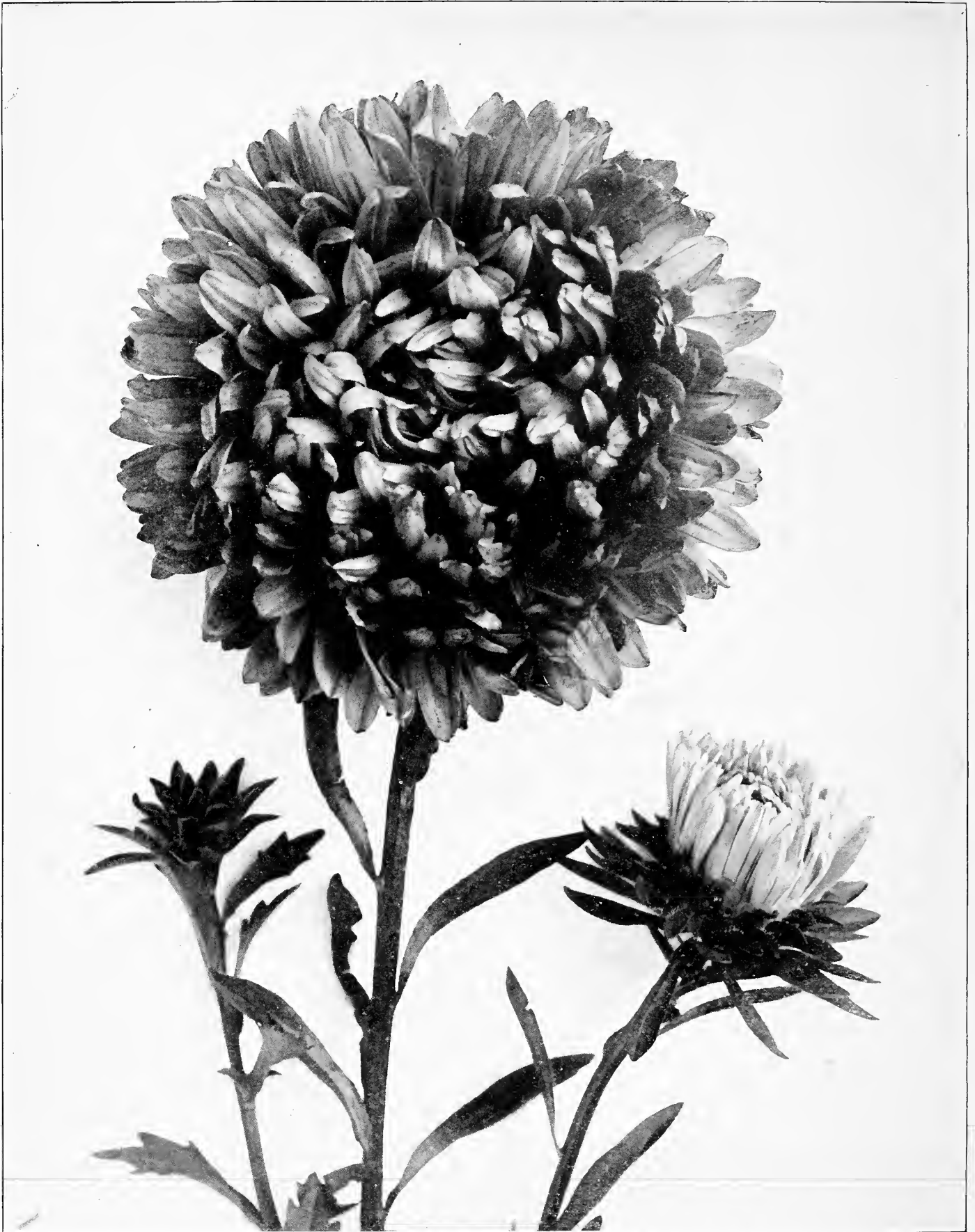
ASTERS—LATE BEAUTY PURPLE